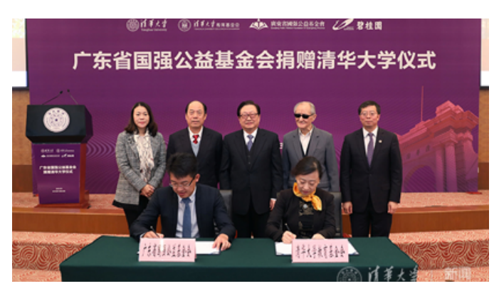
Signing the donation agreement